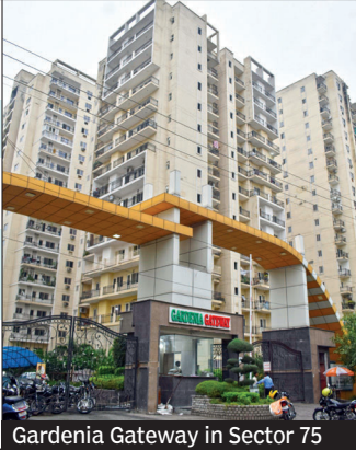
Gardenia Gateway in Sector 75