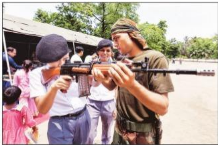
An Army soldier with students during a 'Know Your Army' exhibition in Lucknow. PTI

Tripathi said, "The accident took place near village Kurau on Monday night at around 9.00 pm. Four persons were returning after attending the last rites of a girl of their locality. The motorcycle rammed into a bridge." The bodies of the deceased have been sent for post-mortem. PTI