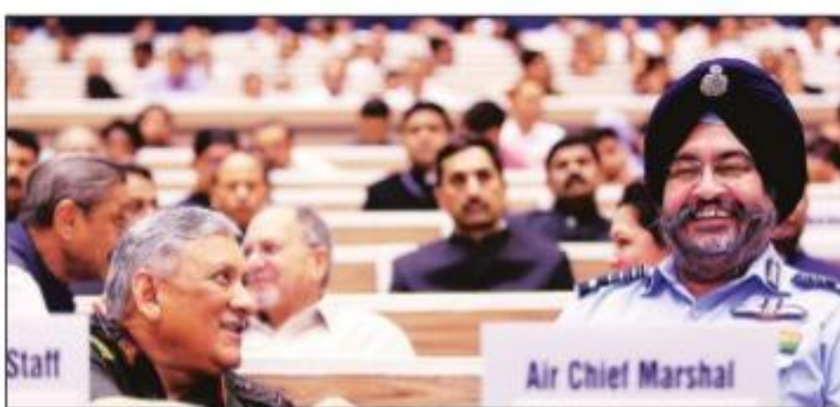
(Above) Chief Justice of India Ranjan Gogoi with CBI Director Rishi Kumar Shukla at the 18th D P Kohli Memorial Lecture in New Delhi; (left) Chief of Army Staff Gen Bipin Rawat and Air Chief Marshal Birender Singh Dhanoa at the lecture.

measure, lie with the executive by virtue of Section 4 of Delhi Special Police Establishment Act, 1946, the possibility of it being used as a political instrument remains ever present."